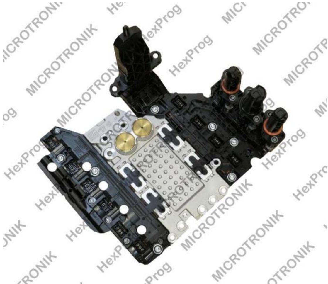
BMW-DKG 436 Gen1-Module

You cannot use OBD Flash files to write into the ECU